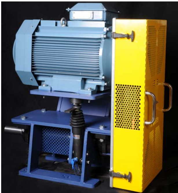
Gemex PTU IEC 200-225

After rebuilding or process changes it is easy to change the rpm on the belt transmission to get the highest efficiency.